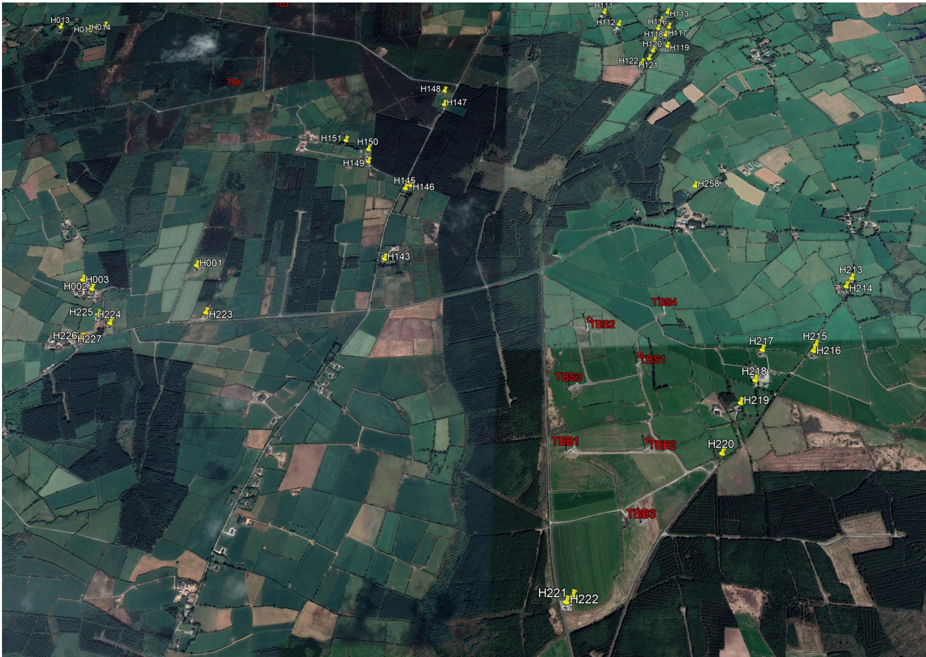
Figure 5: Noise Monitoring Locations to South of Proposed Site