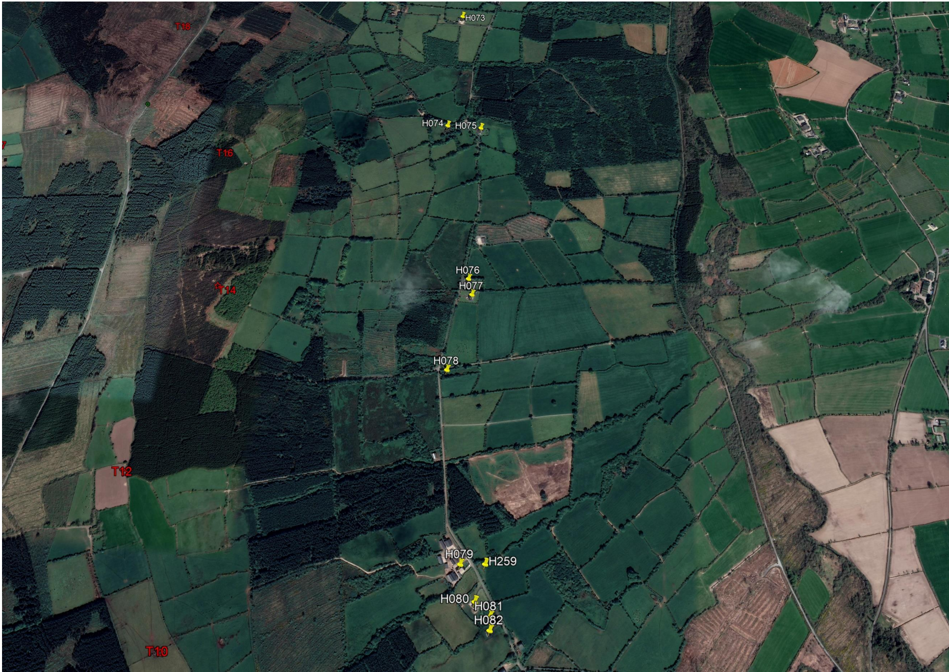
Figure 3: Noise Monitoring Locations to Northeast of Proposed Site