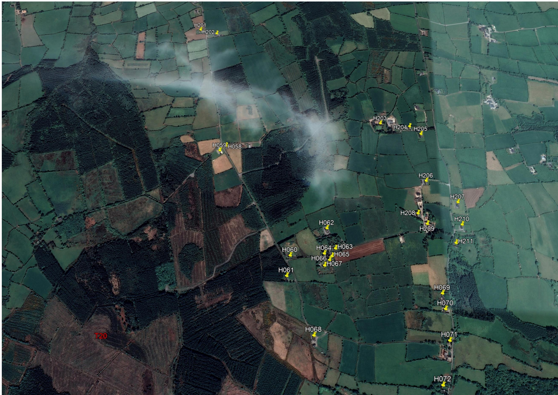
Figure 2: Noise Monitoring Locations to North / Northeast of Proposed Site