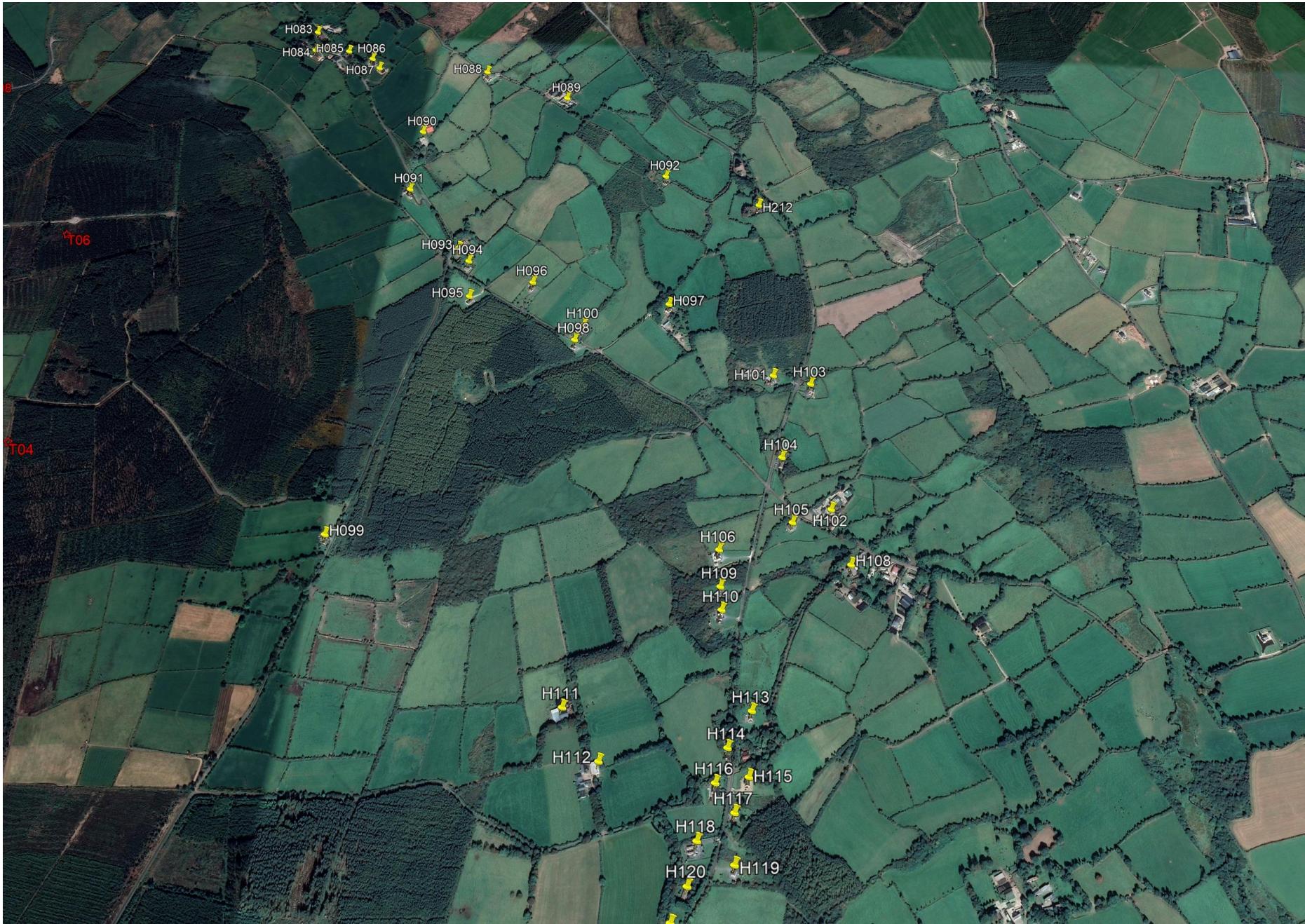
Figure 4: Noise Monitoring Locations to East / Southeast of Proposed Site