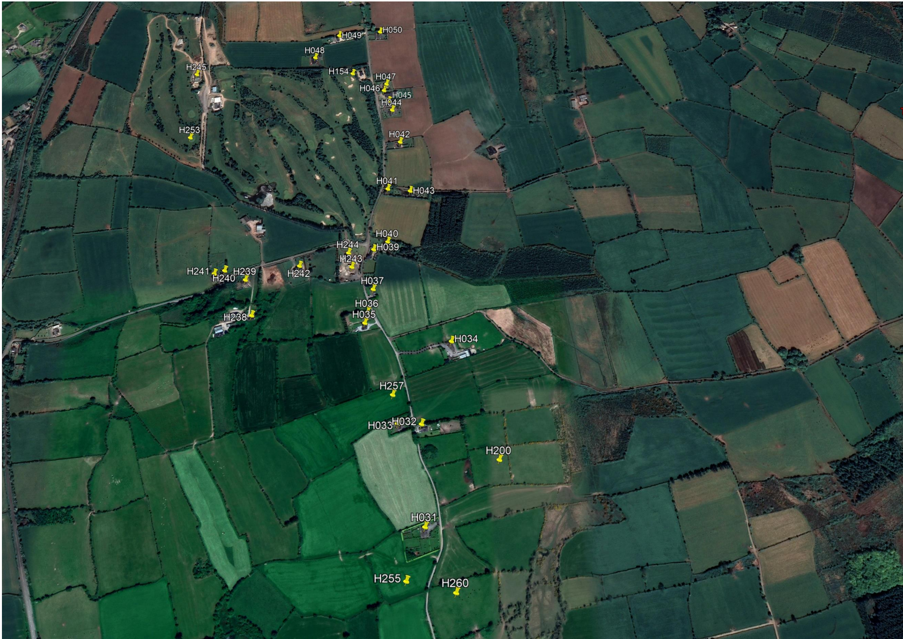
Figure 7: Noise Monitoring Locations to West of Proposed Site