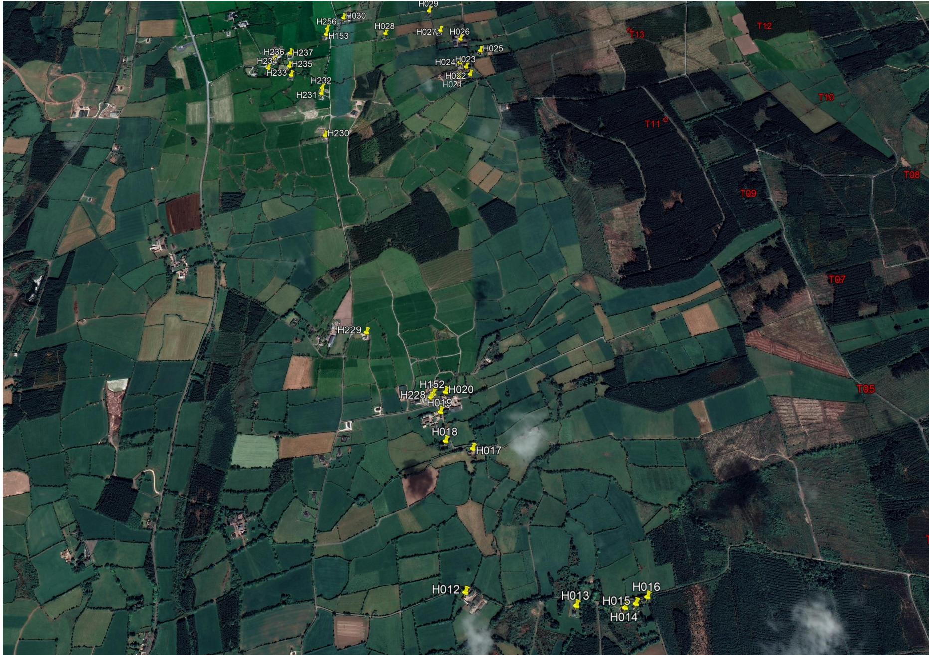
Figure 6: Noise Monitoring Locations to Southwest of Proposed Site