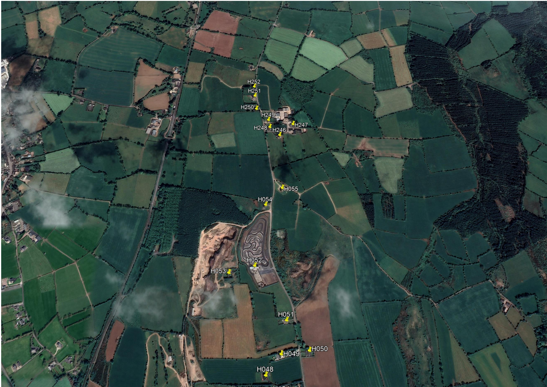
Figure 8: Noise Monitoring Locations to Northwest of Proposed Site